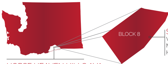
HORSE HEAVEN HILLS AVA Located in South Central Washington

The 2021 vintage was a great one. Early season heat led to smaller berry and cluster sizes which created fruit with great concentration but not much yield. The warmer than average vintage led to very fruit-forward wines with a lot of ripe, fruity aromatics. And probably the best news of all, we managed to avoid smoke and an early freeze this year.