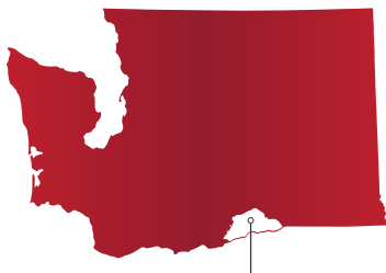
HORSE HEAVEN HILLS AVA Located in South Central Washington

The 2021 vintage was a great one. Early season heat led to smaller berry and cluster sizes which created fruit with great concentration but not much yield. The warmer than average vintage led to very fruit-forward wines with a lot of ripe, fruity aromatics. And probably the best news of all, we managed to avoid smoke and an early freeze this year.